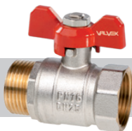
ORO Ball valve with nut on stem and aluminium butterfly handle (female-male version)