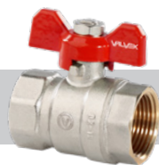
ORO Ball valve with nut on stem and aluminium butterfly handle (female-female version)