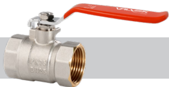
ORO Ball valve with nut on stem and steel lever (female-female version)