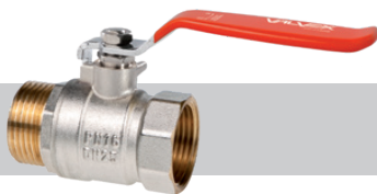
ORO Ball valve with nut on stem and steel lever (female-male version)