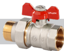
ORO Ball valve with nut on stem, with tail piece and aluminium butterfly handle