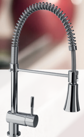
VEGANE - 2451600 standing telescope kitchen mixer