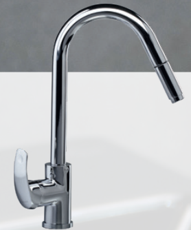
ANGELO - 2453040 standing kitchen mixer with pull-out spray