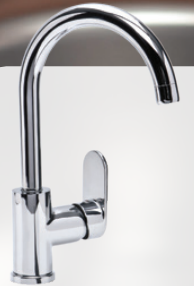
TUBE - 2454860 standing kitchen mixer with side lever