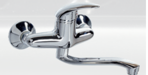
ATLANTA - 2404010 bateria kuchenna ścienna z profilowaną wylewką