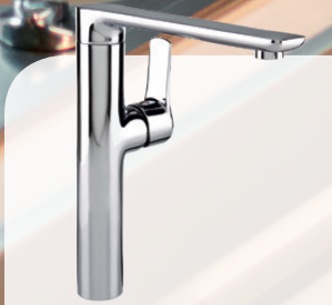
DALI - 2447250 standing kitchen mixer with side lever