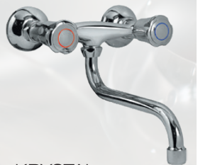
KRYSTAL - 2446500 wall mounted kitchen mixer