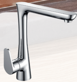
CONNE - 2448950 standing kitchen mixer with side lever