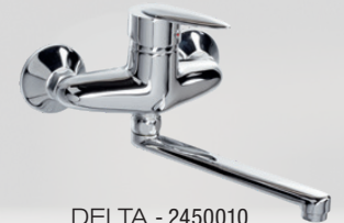
DELTA - 2450010 wall mounted kitchen mixer