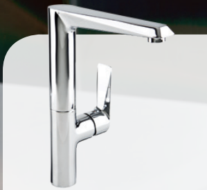
QUASAR - 2446850, 2446857 standing kitchen mixer with side lever