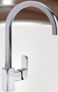
LOFT - 2454960 standing kitchen mixer with side lever