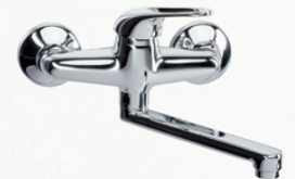
MONA - 2453550 wall mounted kitchen mixer