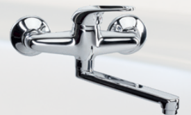
GALEO - 2441030 wall mounted kitchen mixer