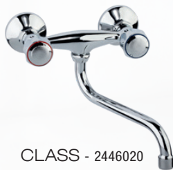
CLASS - 2446020 wall mounted kitchen mixer