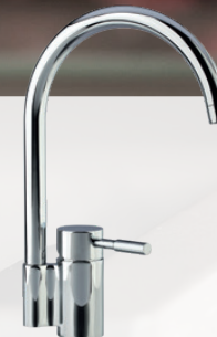
VEGANE - 2451550 standing kitchen mixer with side lever