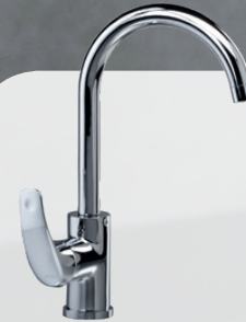
ANGELO - 2453030 standing kitchen mixer with side lever