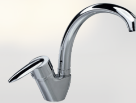
DELTA - 2450070 standing kitchen mixer with side lever