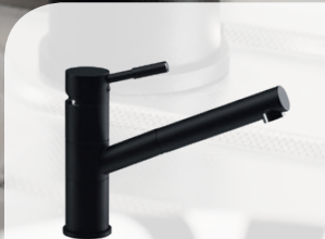
VEGANE NERO - 2451670

standing kitchen mixer with pull-out spray