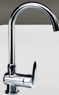
DELTA - 2450060 standing kitchen mixer with side lever

Delta kitchen mixer is a line that co-creates a harmonious and simple interior. Everything in its place, no exaggeration and extravagance. Functionality and order – these are the features of the Delta series. The high, swivel spout creates a comfort zone for the user, ensuring maximum freedom of use of the mixer.