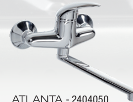
ATLANTA - 2404050 wall mounted kitchen mixer