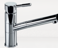
VEGANE - 2451650 standing kitchen mixer with pull-out spray