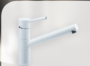
VEGANE BIANCO - 2451660

standing kitchen mixer with pull-out spray